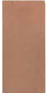
PB-BB2S Two Stubby Paper Bag Brown 305 x 135 + 70 mm 500 / bundle