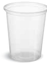
CA-FC200 200 ml Container Clear 77 x 85 mm 50 / sleeve 1000 / carton