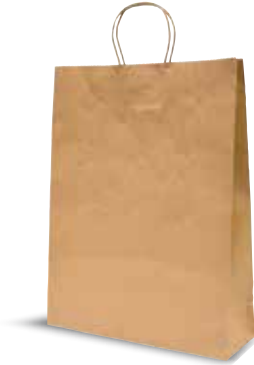
CA-PCBM / CA-PCBM-RET Paper Carry Bag, medium, 14.8L Twisted handle 420 x 320 + 110 mm 250 / bundle Retail packs: 250 / carton 25 / sleeve