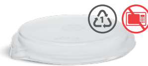
CA-EPKLID Round Lid | rPET Clear, Ø 201 x 27.4 mm 50 / slv 400 / ctn