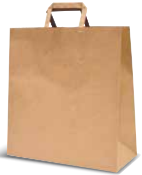
CA-PTBLFH / CA-PTBLFH-RET Paper Takeaway Bag, large, 15.2L Flat handle 340 x 320 + 140 mm 250 / bundle Retail packs: 250 / carton 25 / sleeve