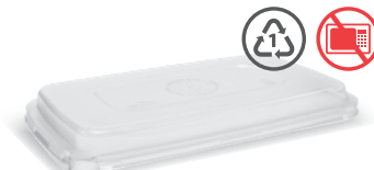
CA-ERCLID Rectangular Lid | rPET Clear, 225 x 135 x 25 mm 50 / slv 500 / ctn