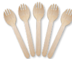
CA-WCSP Wooden Spoons Natural 160 mm 100 / slv 1000 / ctn