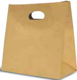
CA-PTBMD / CA-PTBMD-RET Paper Takeaway Bag, medium, 10.5L Die-cut handle 280 x 280 + 150 mm 500 / bundle Retail packs: 500 / carton 50 / sleeve