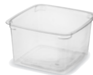
CA-CST300 300 ml Container Clear 90 x 90 x 52 mm 25 / sleeve 500 / carton