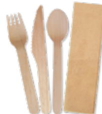
CA-WNAPCUT3 Cutlery Pack, paper wrapped Natural Knife, fork, spoon and 2Ply napkin Napkin: 230 x 230 mm 400 / ctn