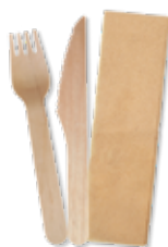
CA-WNAPCUT Cutlery Pack, paper wrapped Natural Knife, fork and 2Ply napkin Napkin: 230 x 230 mm 400 / ctn