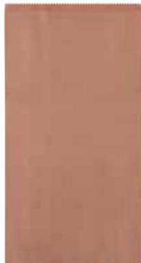
PB-BB3 Triple Bottle Paper Bag Brown 440 x 225 + 112 mm 250 / bundle