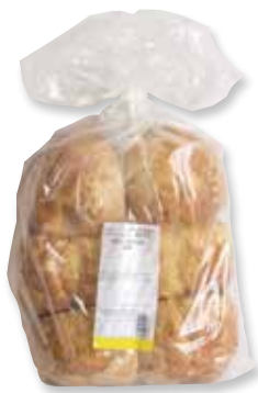
BB-360X510-LGE LDPE 6 roll Natural 360 x 510 mm 1000 / carton