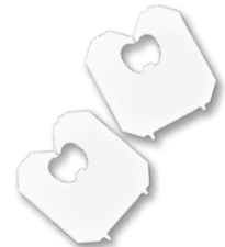
RJ01040712 Kwik-lok bag clips White 23 x 22 mm 20,000 / carton