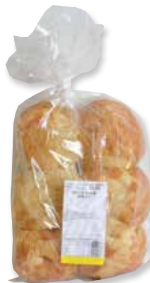
BBM280490 HDPE Crispy Natural 490 x 280 mm 2000 / carton