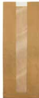
CA-WBLF Loaf paper window bag Brown Kraft 390 x 140 + 70 mm 500 / bundle