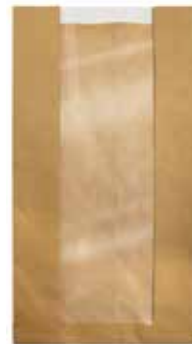
CA-WBCLF COB Loaf paper window bag Brown Kraft 390 x 200 + 100 mm 500 / bundle