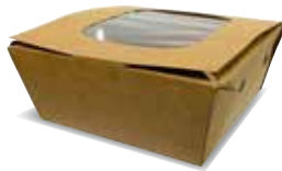
CA-LPWQTR-BRN Medium Kraft Window Boxes Brown kraft 150 x 150 x 60 mm 200 / carton