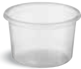
CA-FC100 100 ml Container Clear 77 x 45 mm 50 / sleeve 1000 / carton