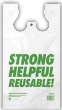
HL-LCB6-35W* Plastic carry bag, large, 12.2L White / printed 530 x 290 x 150 mm 50 / sleeve 1000 / carton