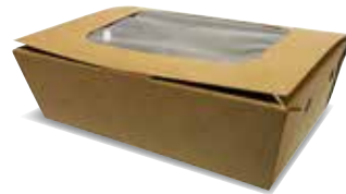
CA-LPWHALF-BRN Large Kraft Window Boxes Brown kraft 210 x 150 x 60 mm 150 / carton