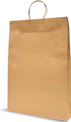
CA-PCBL Paper Carry Bag, large, 14.7L Twisted handle 480 x 340 + 90 mm 250 / bundle