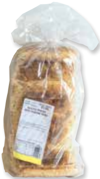
BB-300X480-REG LDPE Single loaf Natural 300 x 480 mm 1000 / carton

PERFORATED POLY BAGS KEEP CRISPY BREADS FRESH