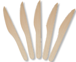
CA-WCK Wooden Knives Natural 165 mm 100 / slv 1000 / ctn