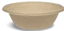
CA-EPK1150 Round Container 1150ml Natural, Ø 200 x 65 mm 50 / slv 400 / ctn