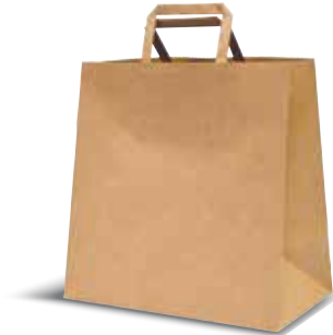
CA-PTBMFH / CA-PTBMFH-RET Paper Takeaway Bag, medium, 11.7L Flat handle 280 x 280 + 150 mm 200 / bundle Retail packs: 200 / carton 25 / sleeve