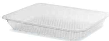
CA-AC119-220 Aqua Cell® Meat Tray 119 Clear 255 x 205 x 34 mm 220 / carton