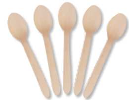
CA-WCS Wooden Spoons Natural 160 mm 100 / slv 1000 / ctn