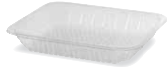
CA-AC87 Aqua Cell® Tray 87 Clear 200 x 175 x 34 mm 380 / carton