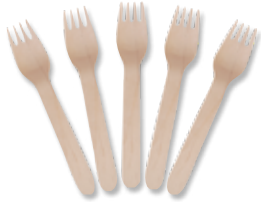
CA-WCF Wooden Forks Natural 160 mm 100 / slv 1000 / ctn