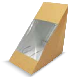
CA-WEDGEMED-BRN Window Paper Sandwich Wedge Brown kraft 123 x 72 x 123 mm 100 / sleeve 500 / carton