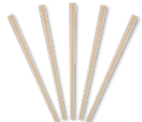
CA-WCCS Chopsticks, paper wrapped Natural 203 mm 100 / slv 3000 / ctn