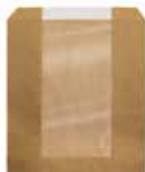
CA-WBSS Single-Serve paper window bag Brown Kraft 250 x 200 mm 500 / bundle