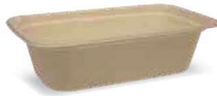
CA-ERC1000 Rectangular Container 1000ml Natural, 220 x 135 x 61 mm 50 / slv 500 / ctn