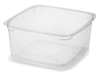
CA-CST250 250 ml Container Clear 90 x 90 x 42 mm 25 / sleeve 500 / carton