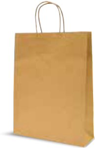
CA-PCBS / CA-PCBS-RET Paper Carry Bag, small, 7L Twisted handle 340 x 260 + 80 mm 250 / bundle Retail packs: 250 / carton 25 / sleeve