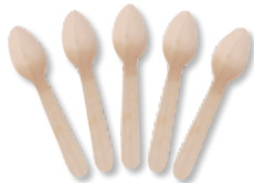
CA-WCT Wooden Teaspoons Natural 110 mm 100 / slv 2000 / ctn