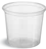
CA-FC150 150 ml Container Clear 77 x 60 mm 50 / sleeve 1000 / carton