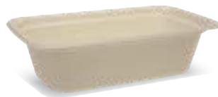
RECTANGULAR 1000 ml

Natural 220 x 135 x 43 mm 50 / slv 500 / ctn