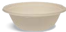
ROUND 1150 ml

Natural Ø 200 x 40 mm 50 / slv 400 / ctn